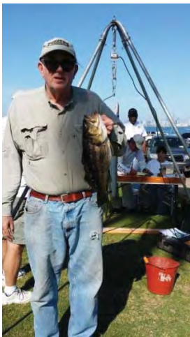
Tim's 4.18lb Calico