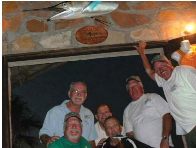
The sign above the door says, "Lou's Landing"!