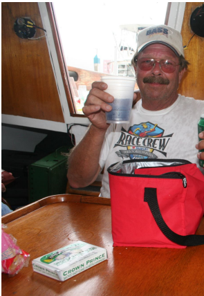
Just Relaxing on my sailboat