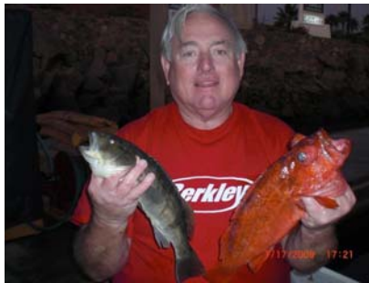
Mixed bag at all depths!