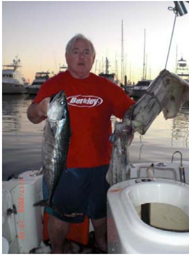
Bonito and Humbolt

If you would like to read the whole story, email me and I will forward it to you ... mailto:mgmouritzen@loanlink.com