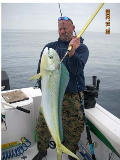
Fox's Nice DoDo at the 425