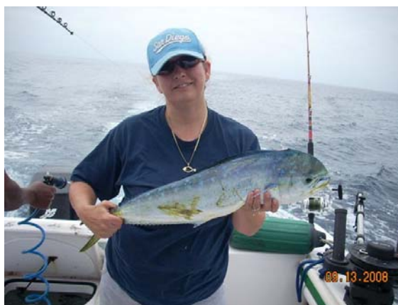
DJ got one too!