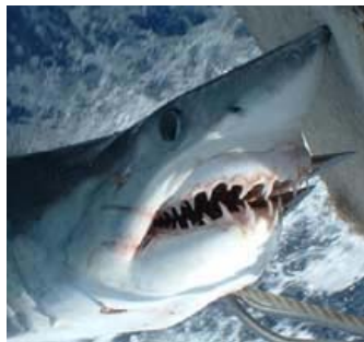
Tournament Master: Lee "Doc" Fleming

Good luck all, and remember tight lines and sharp hooks... Fox..