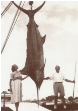
Weigh Master: By: Fox Ludwig

A happy and safe July 4th holiday to all.