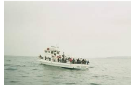
The Children of the Troops Aboard the SeaWatch out of Seaforth Sportfishing. Thanks to all the club members who helped make this event a success!