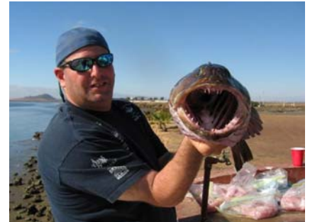
Along with his version of a Mean Joe Green ...